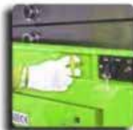
Emergency Lowering System