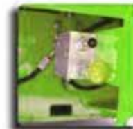
Brake Release Valve