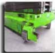
Tight Turning Radius