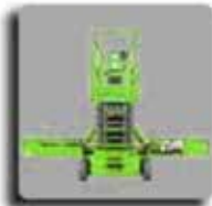
Swing Out Tray