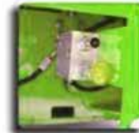
Brake Release Valve