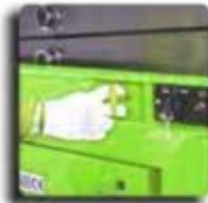
Emergency Lowering System