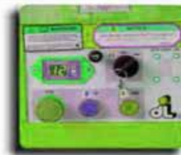
Ground Control With Outrigger LEDs