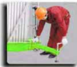
Swing Out Outrigger With Interlock